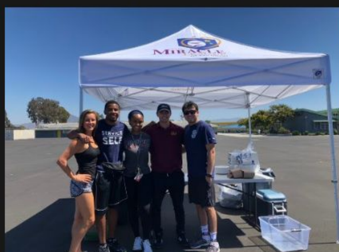
Pictured above: (left to right)

This semester Rotaract of SDSU was invited to facilitate the Miracle League games at their new field at Bell Middle School! After sponsoring teams for the past two seasons with the support of local Rotary Clubs, we are excited to bring our partnership with Miracle League to another level. Miracle League is a non-profit organization dedicated to hosting super fun baseball games for children with disabilities. SDSU Rotaractors will facilitate the games every Saturday until November by taking on the role of announcer/commentator, keeping score, running the snack bar, selling Miracle League merchandise, and being buddies with these amazing kids! Here are some pictures of the first three games of the season!