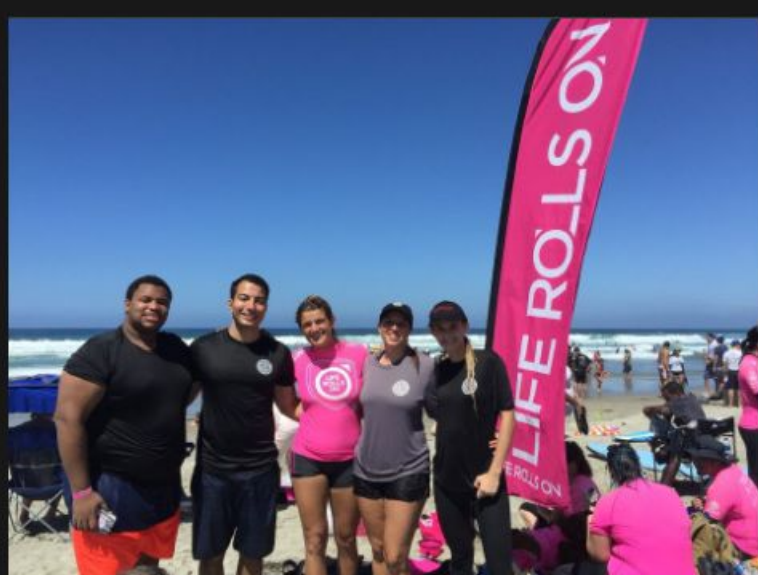
Pictured above: (left to right)