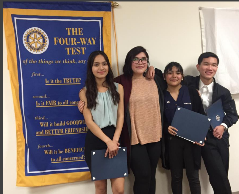
Top Four Competitors of the Four Way Speech Contest Sponsored by Club 33